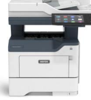
Xerox® VersaLink® B415 Multifunction Printer