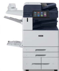
Xerox® AltaLink® B8145/B8155/ B8170 Multifunction Printer

To learn more about Xerox® ConnectKey Technology, go to www.ConnectKey.com .