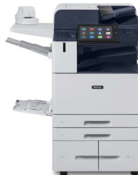
Xerox® AltaLink® C8130/C8135/ C8145/C8155/ C8170 Color Multifunction Printer