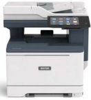
Xerox® VersaLink® C415 Color Multifunction Printer