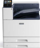
Xerox® VersaLink® C9000 Color Printer