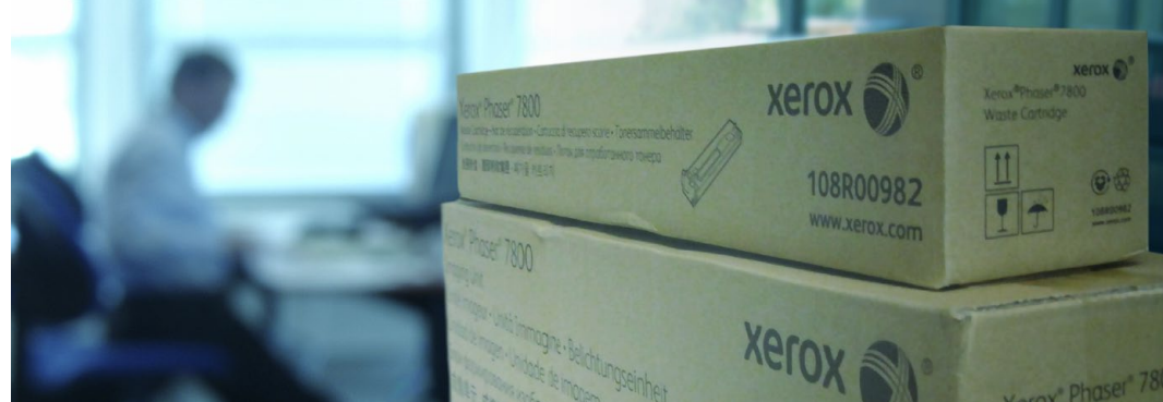
Image quality and office productivity each contribute to business growth. Why risk both with unreliable substitutes? Use only Genuine Xerox Supplies in your Xerox products, to ensure the best image quality and the most reliable † printing, copying and faxing.