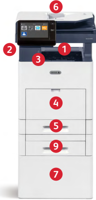
Xerox® VersaLink® B615 Multifunction Printer Print. Copy. Scan. Fax. Email.