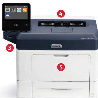
Xerox® VersaLink® B400 Printer Print.

This unmatched balance of hardware technology and software capability helps everyone who interacts with the VersaLink® B400 Printer or VersaLink® B405 Multifunction Printer get more work done, faster.