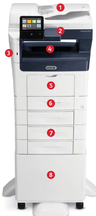
Xerox® VersaLink® B405 Multifunction Printer Print. Copy. Scan. Fax. Email.