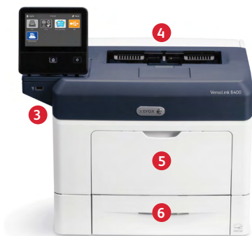
Xerox® VersaLink® B400 Printer Print.