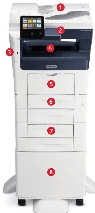
Xerox® VersaLink® B405 Multifunction Printer Print. Copy. Scan. Fax. Email.