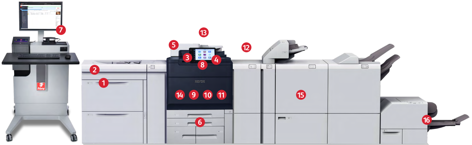
Shown: Fiery® EX Print Server, Two-Tray Oversized High Capacity Feeder, Xerox® PrimeLink® C9200 Series Printer, Crease and Two-Sided Trimmer, Xerox® Production Ready Booklet Maker Finisher, Xerox® SquareFold® Trimmer