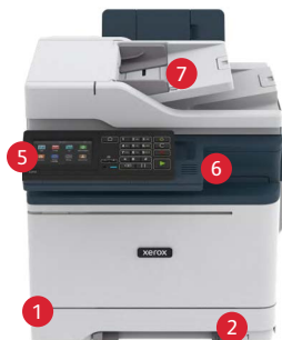
Xerox C315 Color Multifunction Printer