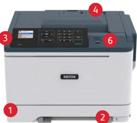
Xerox C310 Color Printer