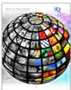
Best of Both Worlds Xerox® 4127 Copier/Printer and Xerox® 700 Digital Color Press