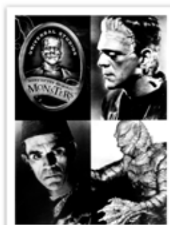
Home of the Original Monsters Xerox® 4127 Copier/Printer