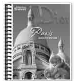
Paris Guide for Visitors Xerox® 4127 Copier/Printer