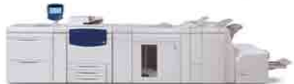
Xerox® 700 Digital Color Press

The Xerox® 700 Digital Color Press and Xerox® 4112®/4127® Copier/Printer and Enterprise Printing System—devices that can put your business in first place. And they've got the awards to prove it.