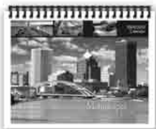
Monoscapes Calendar Xerox® 4127 Copier/Printer