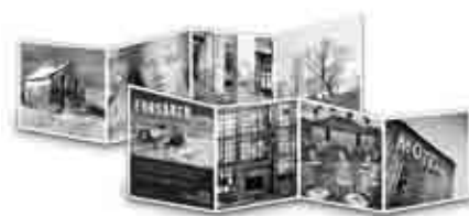
Forsaken AccordionPix® Xerox® 4127 Copier/Printer