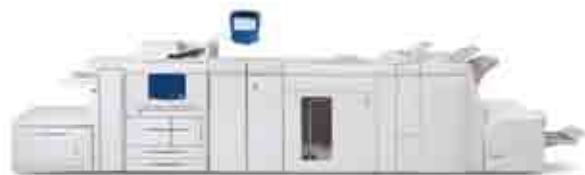
Xerox® 4112/4127 Copier/Printer

For more information, visit www.xerox.com