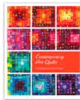
Contemporary Art Quilts Xerox® 700 Digital Color Press