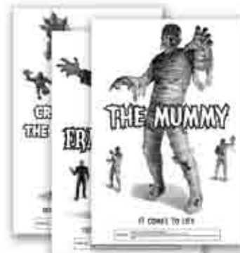
Monsters Posters Xerox® 4127 Copier/Printer