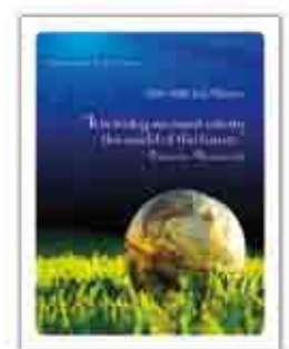
Educator's Edition Day Planner Xerox® 4127 Copier/Printer and Xerox® 700 Digital Color Press