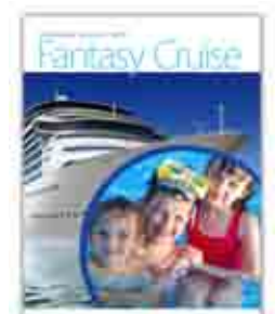
Cruise Vacation Book Xerox® 700 Digital Color Press