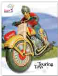
Touring Toys Xerox® 700 Digital Color Press

In image quality, we've achieved the prestigious Gold Ink Award, IAPHC Awards and the DIMA Digital Printer Shoot-Out. Our reliability is celebrated with Better Buys for Business Editor's Choice Awards. Our innovation is applauded by the Digital Imaging Marketing Association (DIMA). And that's just to name a few.