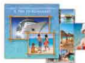
Fantasy Cruise FunFlip® Xerox® 700 Digital Color Press