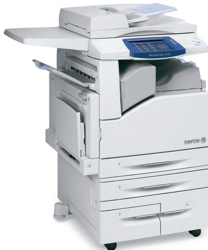
WorkCentre 7435 with Work Surface, High Capacity Tandem Tray and Integrated Office Finisher.