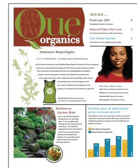
The Phaser 6128MFP produces vivid color and precise detail with up to 600 x 600 dpi image quality.

Whether at your desk or at the Phaser 6128MFP multifunction printer's front panel, current information is available on every job the MFP processes as well as in-depth device status. See the list of jobs currently in the print queue, the number of daily outgoing fax transmissions, paper-level status, and total page output counts without leaving your desk via CentreWare IS or the print driver, or via the device's front panel.