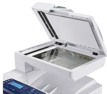
The Phaser 6128MFP features a platen glass for single-sheet scanning and copying, plus a standard 35-sheet Automatic Document Feeder for larger scan and copy jobs.